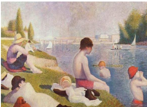
Bathers at Asnieres